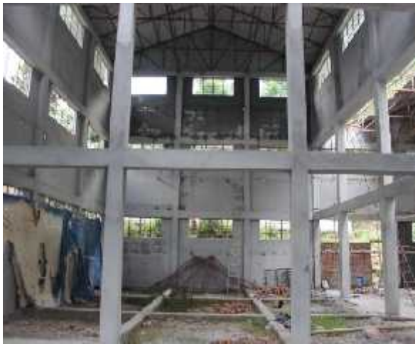
Main Plant Area